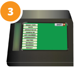
Read Results in Less Than 5 Seconds