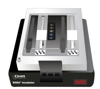
For Batch Processing

Incubate multiple strips simultaneously, then read results in the Charm EZ-M system.