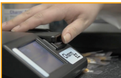
Charm EZ® System