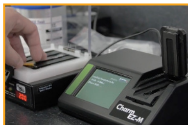
Charm EZ-M® System