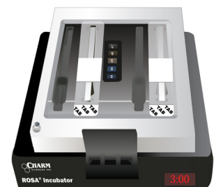
For Batch Processing

Incubate multiple strips simultaneously, then read results in the Charm EZ system.