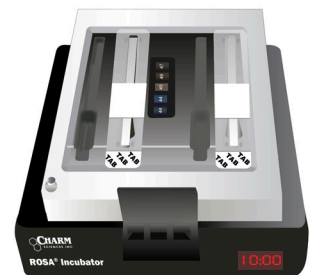
For Batch Processing

Incubate multiple strips simultaneously, then read results in the Charm EZ-M system.