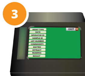
Read Results in Less Than 5 Seconds