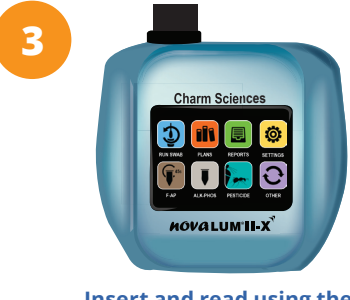
Insert and read using the novaLUM<sup>®</sup> II-X System