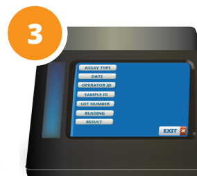
Read Results in Less Than 5 Seconds!