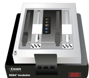
For Batch Processing

Incubate multiple strips simultaneously, then read results in the Charm EZ system.