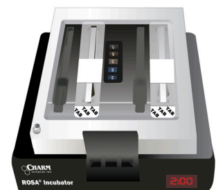
For Batch Processing

Incubate multiple strips simultaneously, then read results in the Charm EZ-M system.