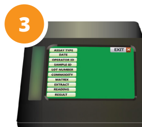
Read Results in Less Than 5 Seconds