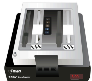
For Batch Processing

Incubate multiple strips simultaneously, then read results in the Charm EZ-M system.