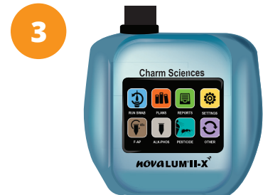
3 Insert and read using the noVALUM® II-X System