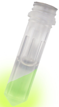
F-AP Fast Alkaline Phosphatase Test

† Creams and chocolate milks require 90 second analysis