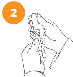
2 Mix and attach adapter