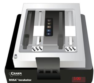
For Batch Processing

Incubate multiple strips simultaneously, then read results in the Charm EZ system.