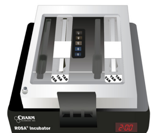
For Batch Processing

Incubate multiple strips simultaneously, then read results in the Charm EZ system.