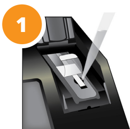
1 Add Sample