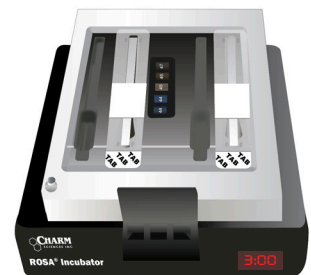
For Batch Processing

Incubate multiple strips simultaneously, then read results in the Charm EZ-M system.