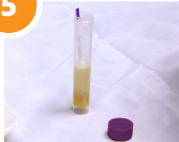
Let sit for 5 minutes.