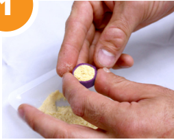
Put ground sample in MycoTube.