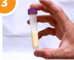
Shake and settle.