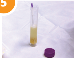
Let sit for 5 minutes.