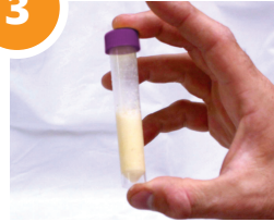
Shake and settle.