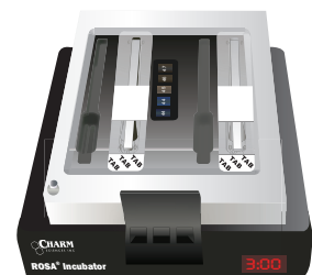
For batch processing, incubate multiple strips simultaneously, then read results in the Charm EZ system.