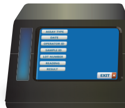
Read results in less than 5 seconds!