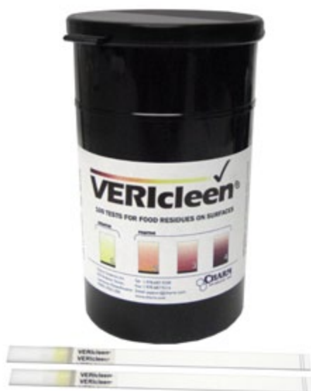
VERIclean® Test Kit

“In all cases, the results obtained were consistent and easy to interpret and were attainable within one minute of sampling the surface” [Figure 1]