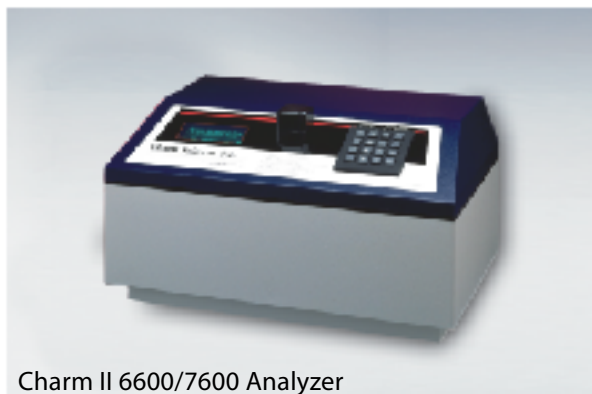
Charm II 6600/7600 Analyzer